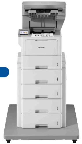
HL-L6415dw / HL-EX415dw PLUS TOWER TRAY AND STAPLER FINISHER OPTIONS