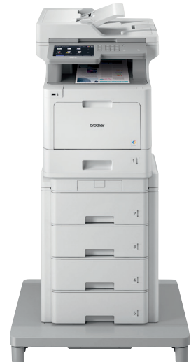
MFC-L9570cdw PLUS TOWER TRAY WITH CONNECTOR OPTIONS