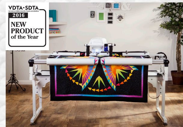
THE Dream Fabric Frame