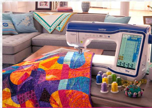
THE Dream Machine